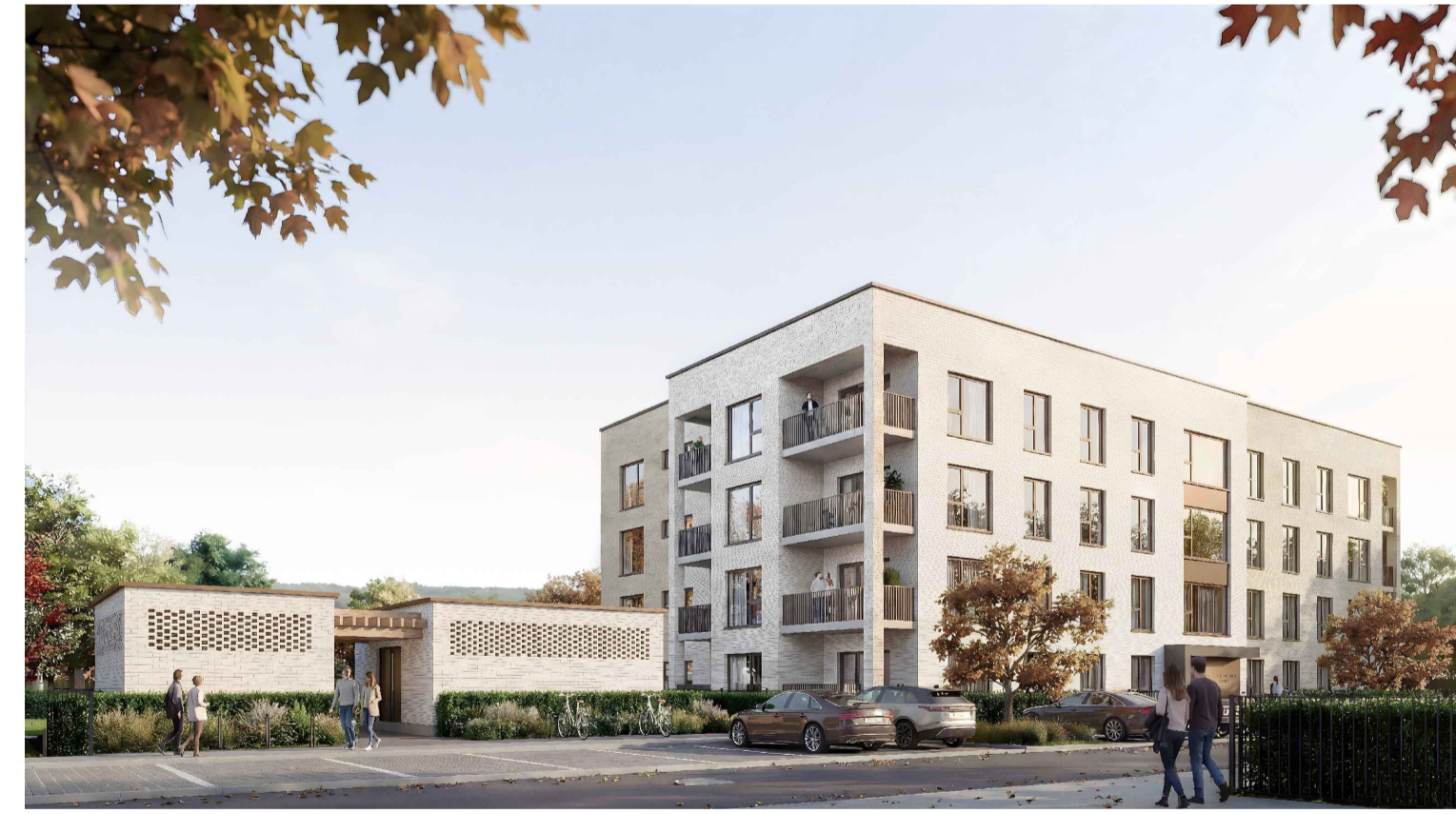
CHARACTER AREA 3 CONTEMPORARY APARTMENTS TO LOWER END OF SCHEME WITH SOUTHERN ASPECT TO THE RIVER BOYNE, YELLOW BRICK & WHITE BRICK WITH METAL CLADDING DETAILING.