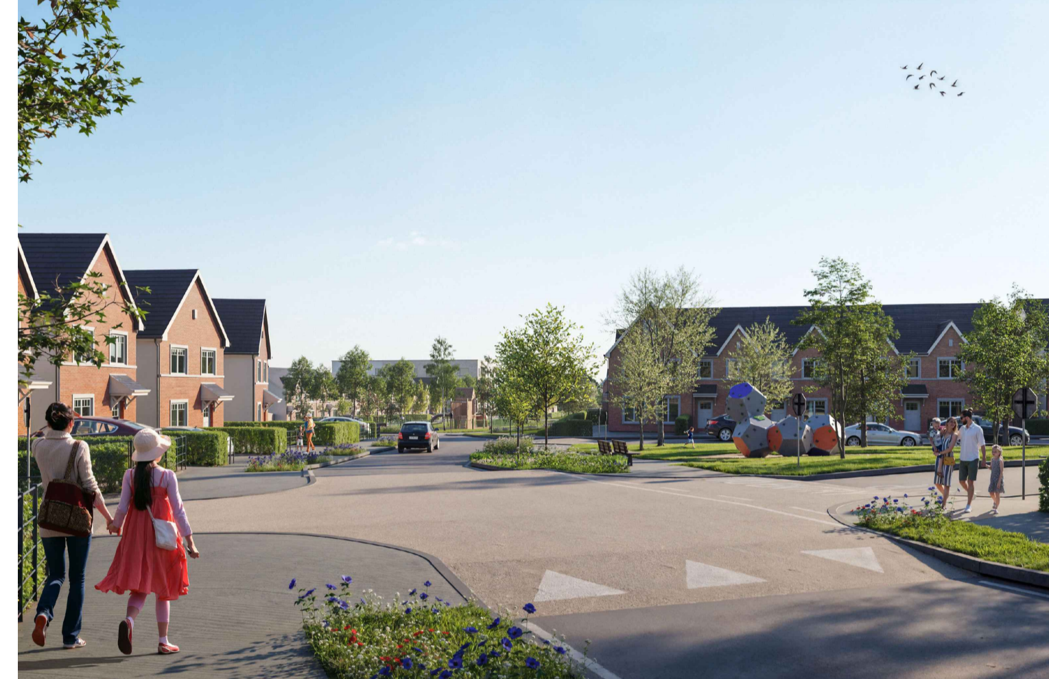
CHARACTER AREA 2 TWO STOREY BRICK FINISH WITH LIMESTONE DETAILING MIX OF DETACHED, SEMI-DETACHED & TERRACED HOUSING TO CENTRAL AREA