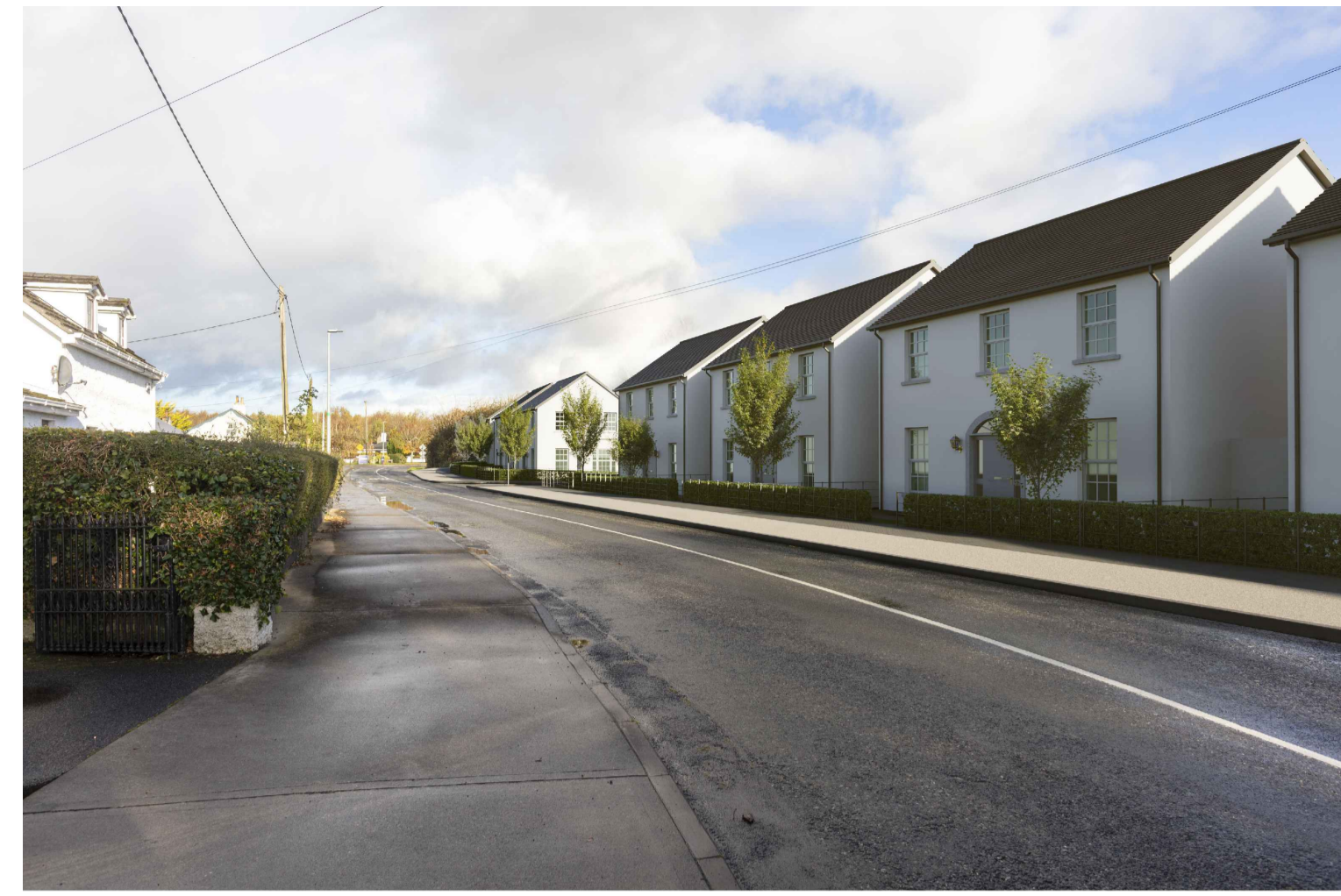
CHARACTER AREA 1 TRADITIONAL TWO STOREY RENDERED DETACHED HOUSING ALONG KILDALKEY ROAD FRONTAGE